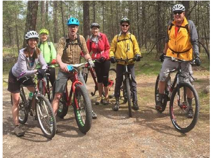
Our Club's First Mt. Bike Ride