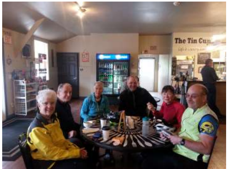
Monday Morning Traditional ride having lunch at the Tin Cup

MAY IS BIKE EVERYWHERE MONTH Grab Some Friends and Join the Rides Check out 2017 Events at SpokaneBikes.org