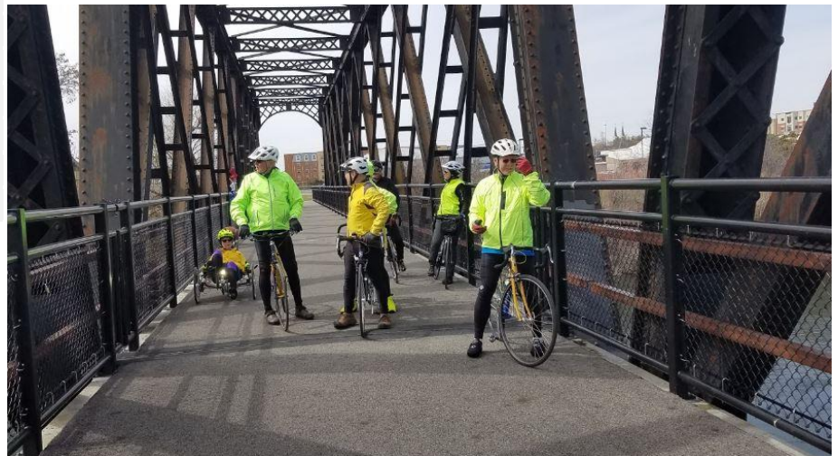
Saturday Steady and Leisurely Ride to the Iron Bridge