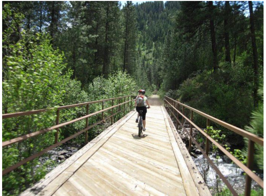
Late Registration is still available for the Weiser River Trail ride. See inside for details.